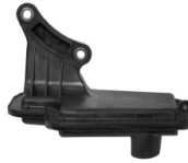
91800 Jaguar 99-Up