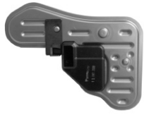
FILTER DPO (AL4) 71800D