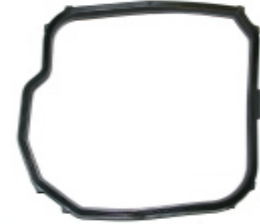
Gasket Valve Body Cover 13971DR